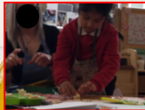
Rolling it up into a spiral