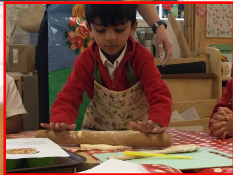
Rolling it out