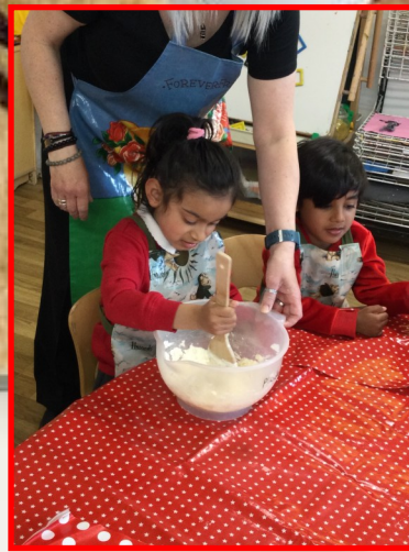
Mixing and stirring