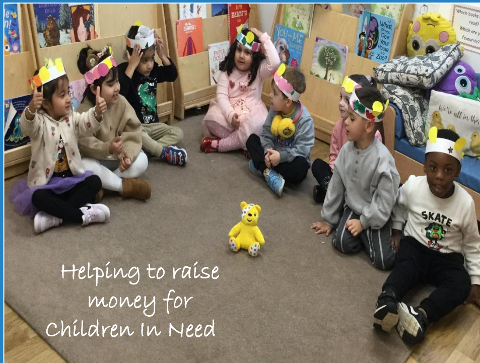
Helping to raise money for Children in Need