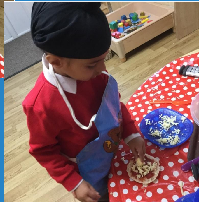
Sprinkling the cheese