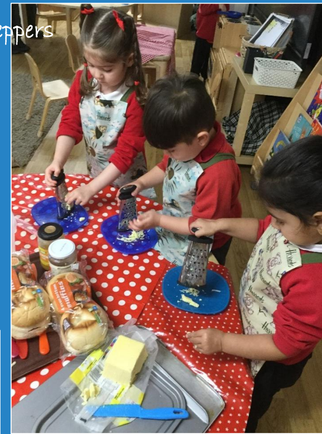
Grating the cubes of cheese