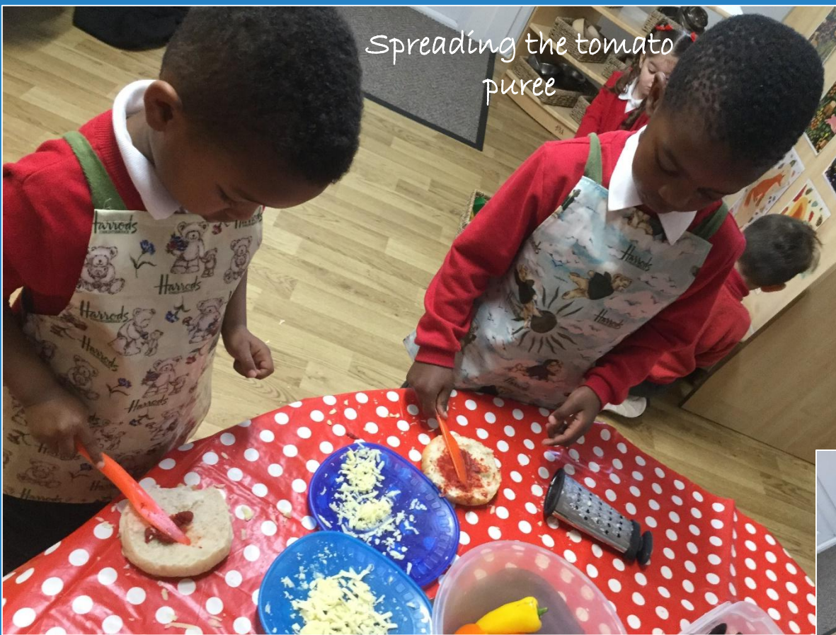
Spreading the tomato puree