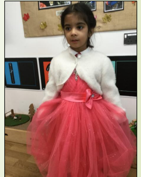
World Book Day; Red Group dress up as their favourite story characters