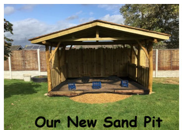
Our New Sand Pit