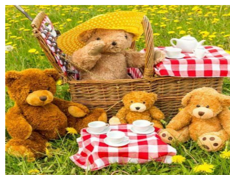
Teddy Bears Picnic—Friday 12th July

Open Days As stated in the notable dates section, your child will be having an open day. This is a chance for parents to meet with their child's group leader to discuss their progress at Nursery. Please see your child's group leader to book an appointment.