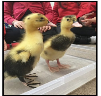
Our Recent Nursery Visitors.